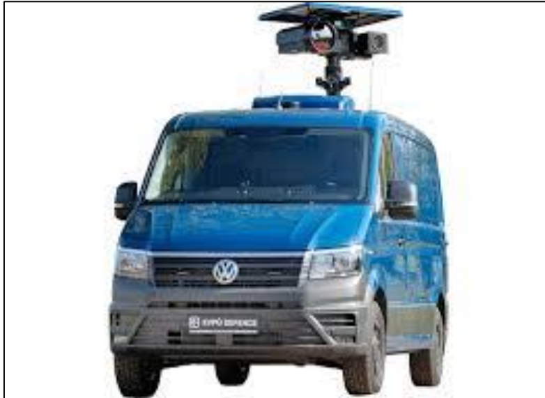
Fig 1 Smart video surveillance

The vehicle at the core of the system functions as both a surveillance unit and a notice announcement device, making it capable of providing continuous video monitoring while simultaneously broadcasting important announcements across various parts of the campus. Powered by a solar panel and a 12V battery, the system ensures sustainable operation throughout the day and night, eliminating the need for frequent recharging or reliance on external power sources.