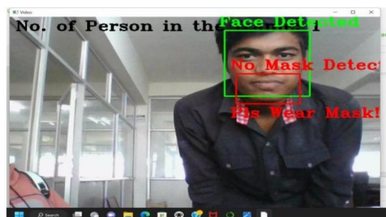
Fig2. The bounding box above the person's face suggests that they are wearing a mask, even though that is not necessarily the case.