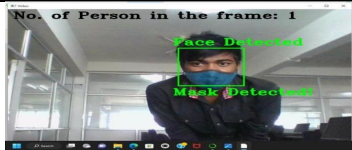
Fig3. A person donning a disguise in Figure 3. The mask-wearer's face is encased in a bounding box.