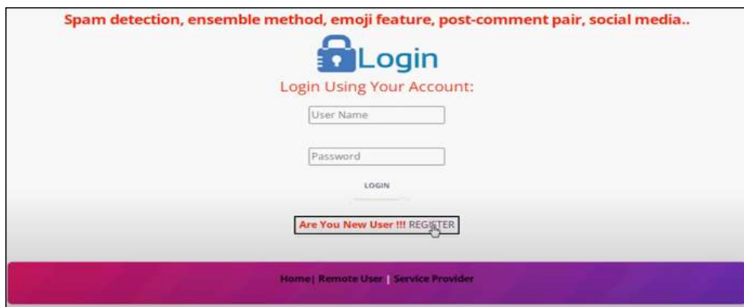
Fig2 Login using your Account