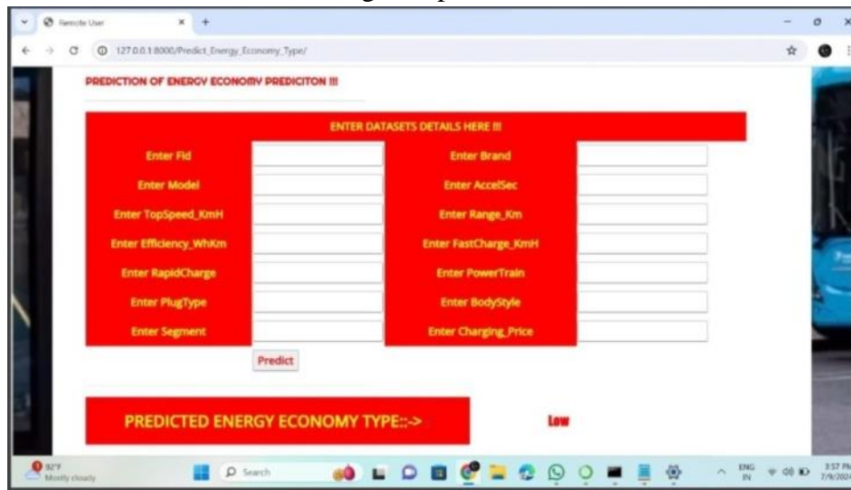
Fig 2: Prediction