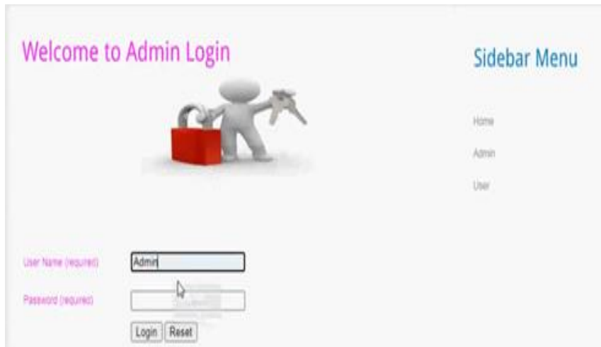
Figure 1 Admin login