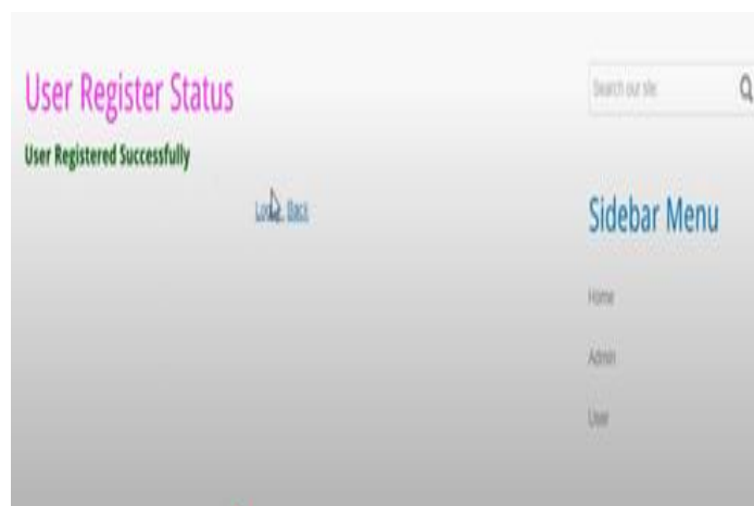
Figure 5 User Register Statuses