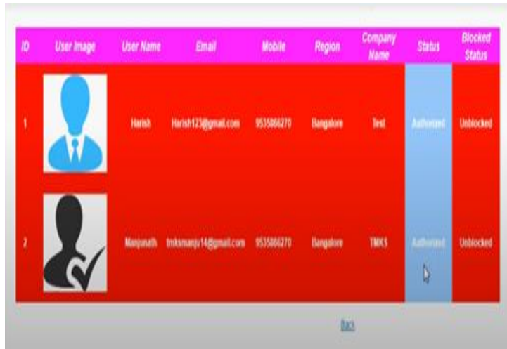
Figure 6 User Statuses