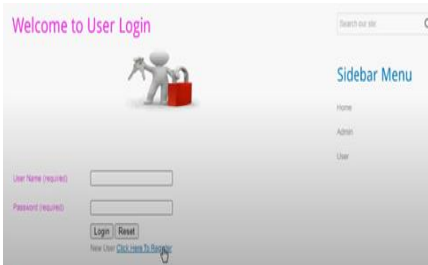
Figure 3 User Login