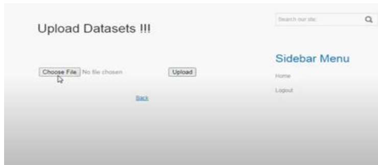
Figure 7 Uploading Data Set