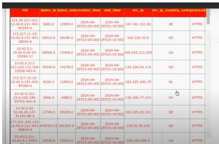
Figure 8 Data Set