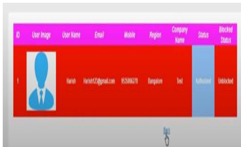
Figure 2 User Details