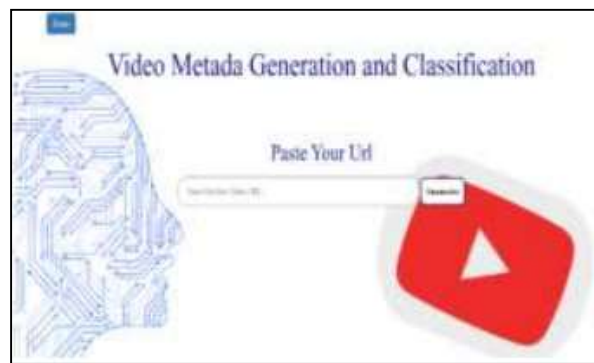
Figure3.Front end application to upload URL