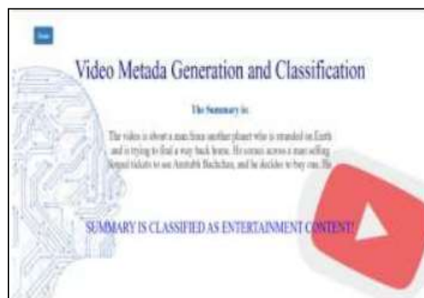
Figure5.Summary generation and classification