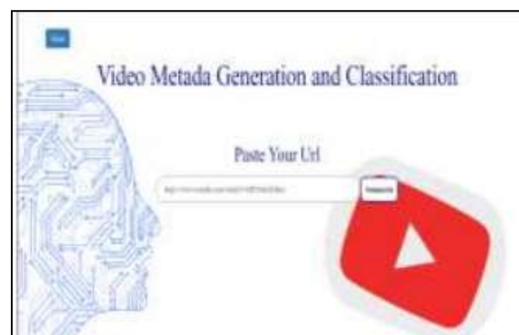
Figure4.URL is uploaded for classification