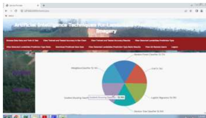
Figure 4: Detected Landslides Prediction in Pie Chart