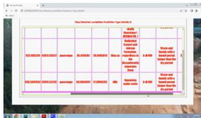
Figure 3: Detected Landslides Prediction Type Details