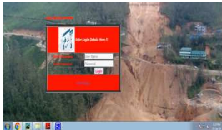
Figure 9: Service Provider Login Page