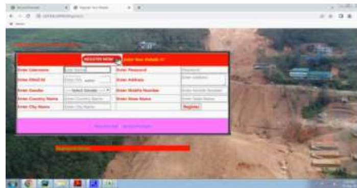
Figure 1: User Registration Page