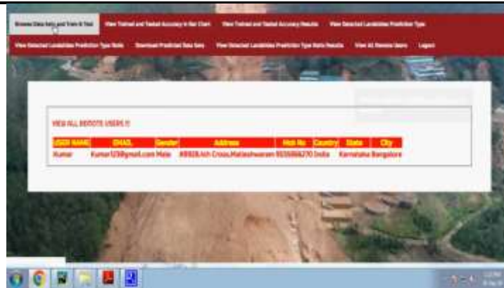
Figure 8: All Users Page