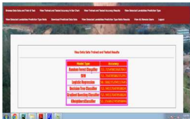
Figure 7: Datasets Trained and Tested Results