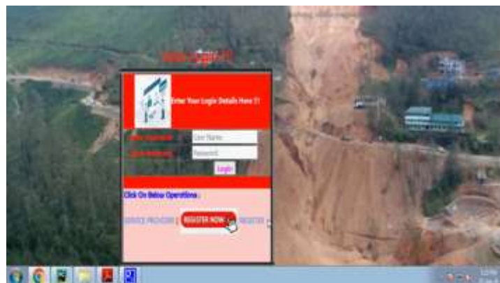
Figure 10: User Login Page