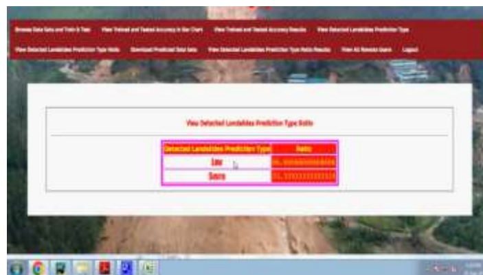
Figure 2: Detected Landslides Prediction Type Ratio