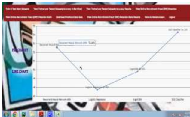
Figure .7: Results from the Detection Ratio of a Line Diagram