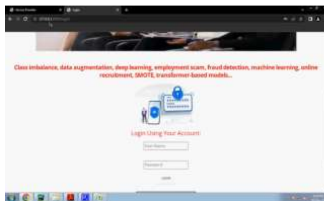
Figure .2: Login Page for Users