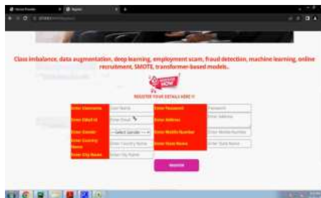
Figure .3: User Registration Form