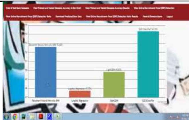
Figure .8: The bar graphic illustrates the Detection Ratio