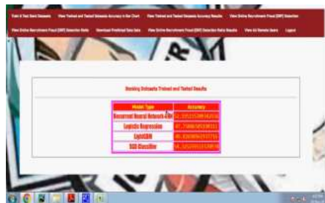
Figure .9: Training Datasets and Experimental Results