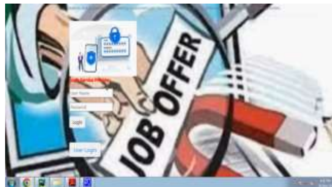
Figure .10: Register as a service provider