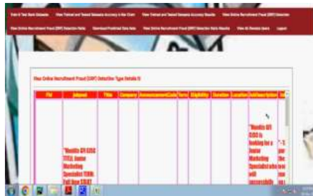
Figure .5: ORF detection type details page