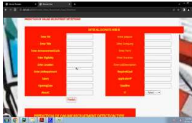
Figure .1: Forecasting Online Recruitment Detection Platforms